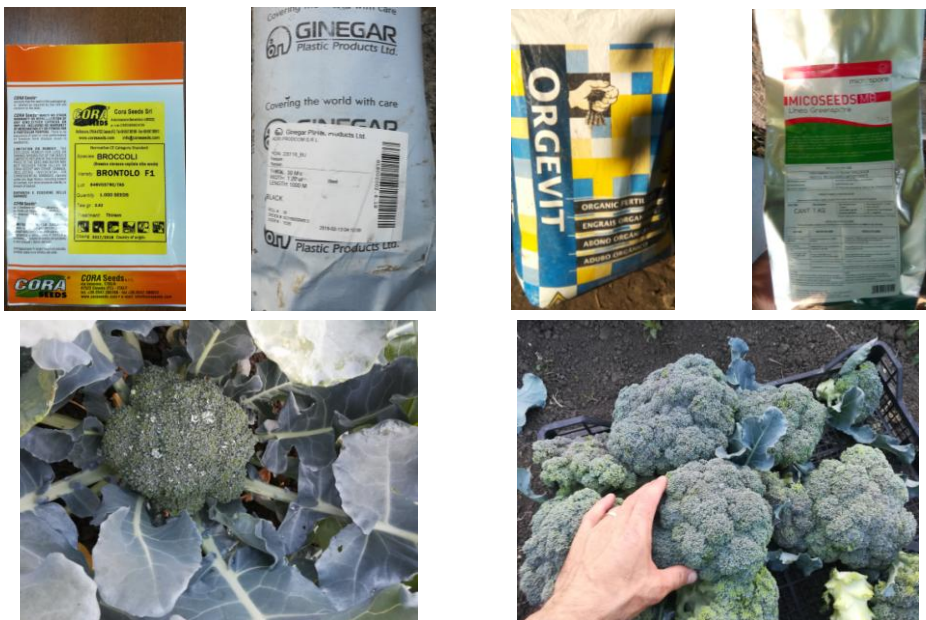
Fig. 1 Aspects from the broccoli experiment

The experimental data was processed by appropriate statistical-mathematical methods (Jitareanu, 1999; Leonte and Simioniuc, 2018). The least significant differences (LSD) test was used for the yields, and the Anova test for the chlorophyll content.